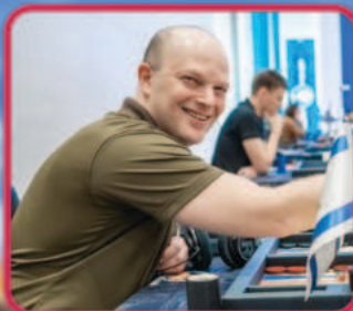
BOOT CAMP DIRECTOR